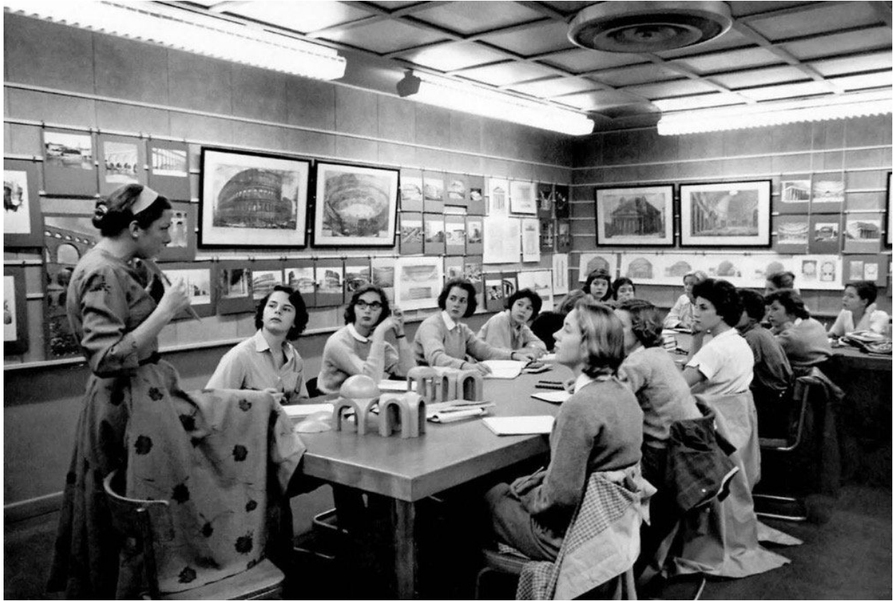
Linda Nochlin teaching at Vassar College in 1959.