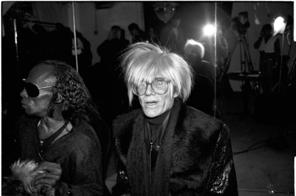
Andy Warhol pictured with Miles Davis.

We review the new documentary, and showcase Warhol's impact on modern culture through three artists: Deborah Kass, Jeff Koons and Glenn Ligon