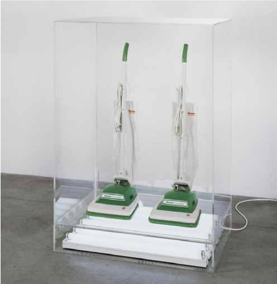
Jeff Koons, New Hoover Convertibles, 1984

Koons has made a USP from hoovering up art history – executed in literal terms with his 1980s vacuum cleaner readymades, and in a Duchampian vein, revising it into something entirely new.