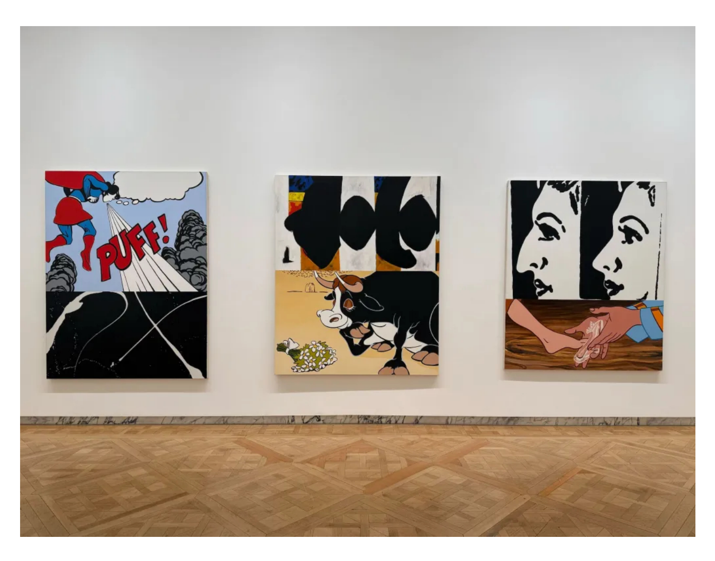
Salon 94 , 3 East 89th Street, Upper East Side, Manhattan Through March 29

Installation view of Deborah Kass: The Art History Paintings 1989–1992 at Salon 94