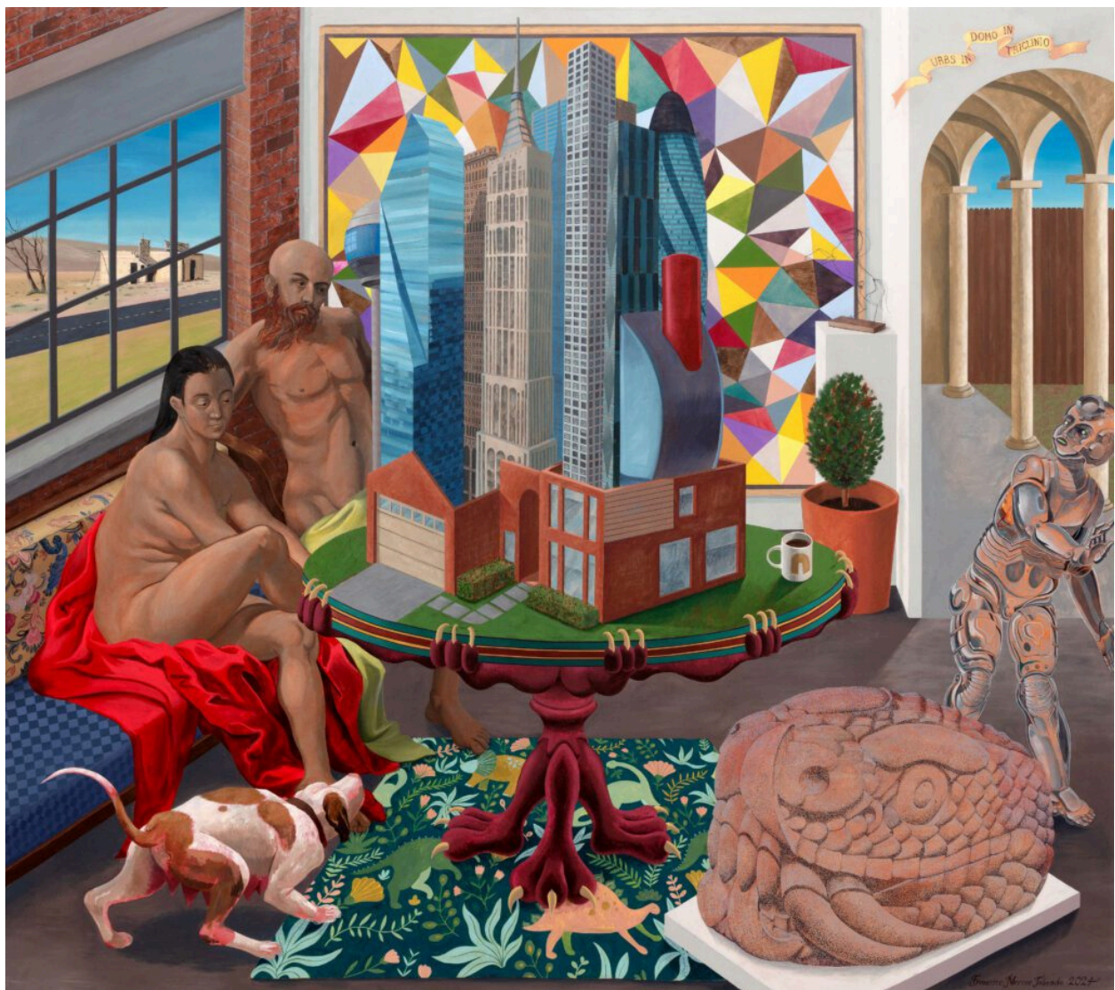
Francisco Moreno, A City in a House in a Room , 2024, at Dallas Contemporary