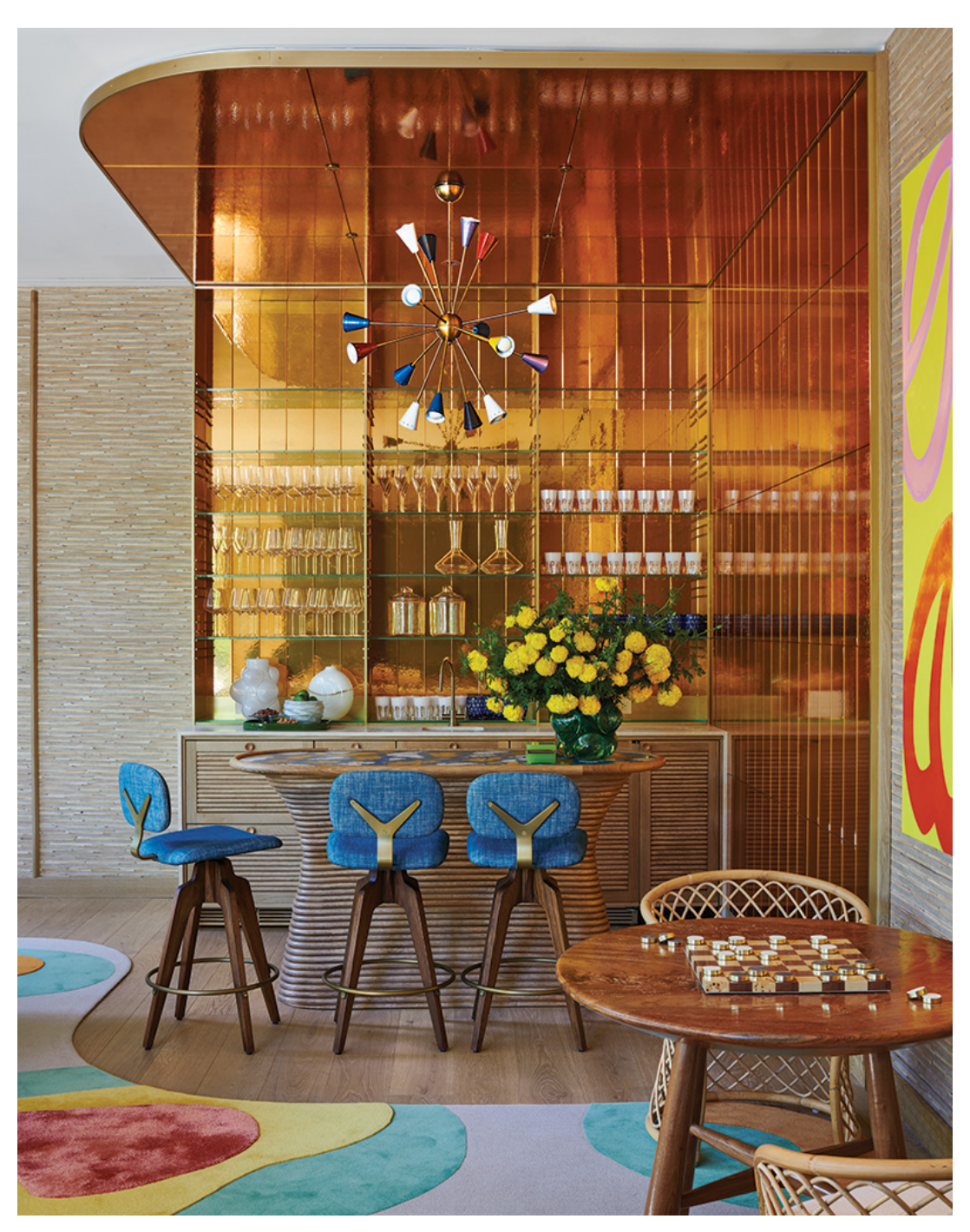
Panels of bronze-toned mirror line the game room area, which features a 1950s Stilnovo chandelier over a bamboo-wrapped bar with seating by Astele. The painting Enough Already by Deborah Kass hangs next to an Andrianna Shamaris reclaimed-teak table and Bonacina chairs.