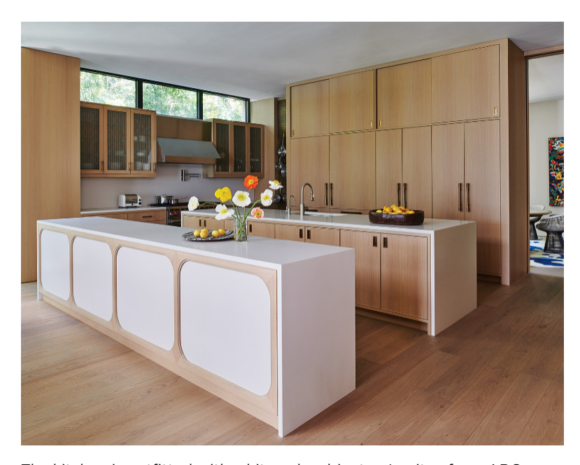
The kitchen is outfitted with white oak cabinetry, Lapitec from ABC Stone countertops, and Waterstone sink fixtures.

PHOTO: RICHARD POWERS; STYLED BY ANITA SARSIDI